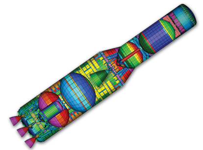
System-level analysis model