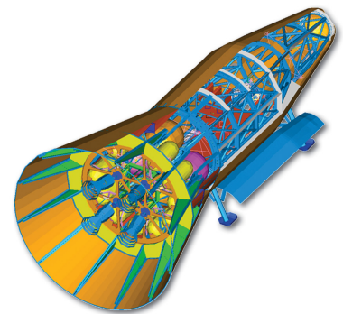
System-level finite element model

The Lockheed Martin launch Pad Abort Demonstrator (PAD) was used as a test bed to demonstrate crew escape technologies and validate analytical models for future crew escape systems. The PAD test bed was designed to use fully instrumented mannequins to provide data on crew environments during test and checkout of crew escape propulsion systems, parachute deployment, vehicle orientation, landing techniques, and external aeroshell configurations. Lockheed Martin asked ATA to develop loads for flight and ground handling, including structural, thermal, and vibroacoustic environments. Over a period of five months, ATA used a variety of advanced analysis tools, including Abaqus, I-deas, NX Nastran, and MATLAB, to demonstrate feasibility of the concept.