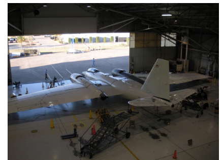
WB-57 undergoing ground vibration testing