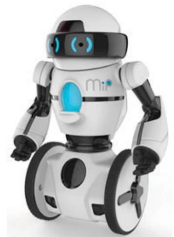
Consumer version of MiP (produced and marketed by WowWee)