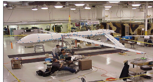
➤ Ground vibration test