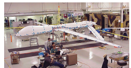
Ground vibration test