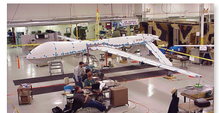
Ground vibration test