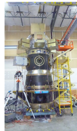
Modal test of the IPS

Spaceflight Industries (Spaceflight) is a launch services and mission management provider. For Spaceflight's Sun-Synchronous Orbit Mission A (SSO-A), a rocket launch provider delivered Spaceflight's integrated payload stack (IPS) to orbit. The mission included ~20 large (>50 kg) payloads, along with several dozen very small payloads. In preparation for the launch, ATA Engineering (ATA) was contracted by Spaceflight to develop a finite element model (FEM) of the IPS, conduct a modal test of the IPS with simulated payloads attached, and correlate the IPS FEM to the modal test results. The IPS model was then used to (1) provide a dynamic model of the full launch payload for use in launch analyses, and (2) determine the random vibration environment at each payload interface, for possible use by the payload suppliers to qualify their payloads for launch. The IPS was successfully launched into orbit on December 3, 2018.