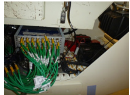
ATA's portable HBM SoMat data acquisition equipment was used for rigorous onboard test applications

Inova Geophysical manufactured the UniVib™ (PLS-326) small vibrator vehicle used for vibroseismic operations during oil and gas exploration. ATA provided operational test services for three variations of the UniVib vehicle. Over the course of multiple days, the vehicles were driven over a rigorous course to simulate various operational conditions while a robust SoMat data acquisition system was employed to acquire critical strain and acceleration data. Data was reviewed in near real time to quantify the severity of the events and make qualitative assessments on the integrity of the various vehicle configurations. ATA's support proved valuable in validating the robustness of the vehicle design and ensuring that Inova's customers receive the highest-quality vehicle products that minimize maintenance and maximize productivity during their extensive exploration operations.