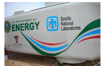
Nacelles and hubs were tested to determine mass and inertia