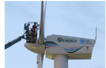
Full turbines were tested to obtain frequencies for model comparison