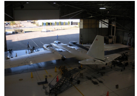
WB-57 undergoing ground vibration testing

NASA operates three WB-57F Canberra aircraft for high-altitude research and development missions. Recognizing an opportunity to greatly increase the utility of these aircraft, NASA contracted ATA Engineering to provide support for a gross weight increase program. Rather than perform a time-intensive complete recertification effort involving detailed stress analysis of the entire airframe, ATA developed a series of flight envelope restrictions to allow the aircraft to be operated at increased weights without exceeding the original design loads of the aircraft. These aircraft now operate at gross weights up to 14% higher than the previous limits, allowing for numerous combinations of increased payloads, longer loiter times, and longer ranges.